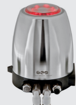
Stainless Steel KI-TOP Control Head