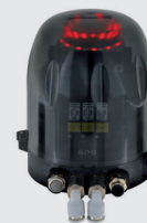
Plastic KI-TOP Control Head