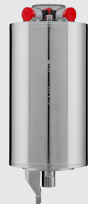
Pneumatic Actuator with Position Indicator